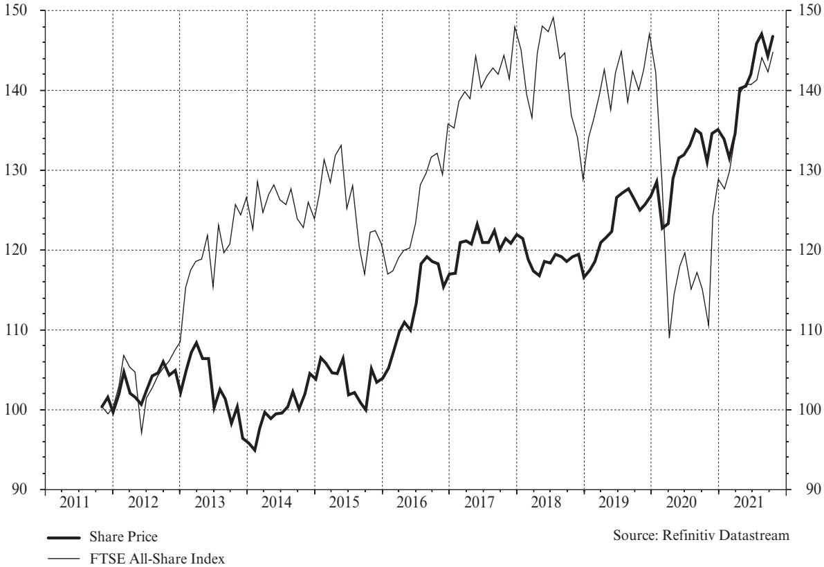
Personal Assets Total Return versus FTSE All-Share Index Total Return (based to 100)