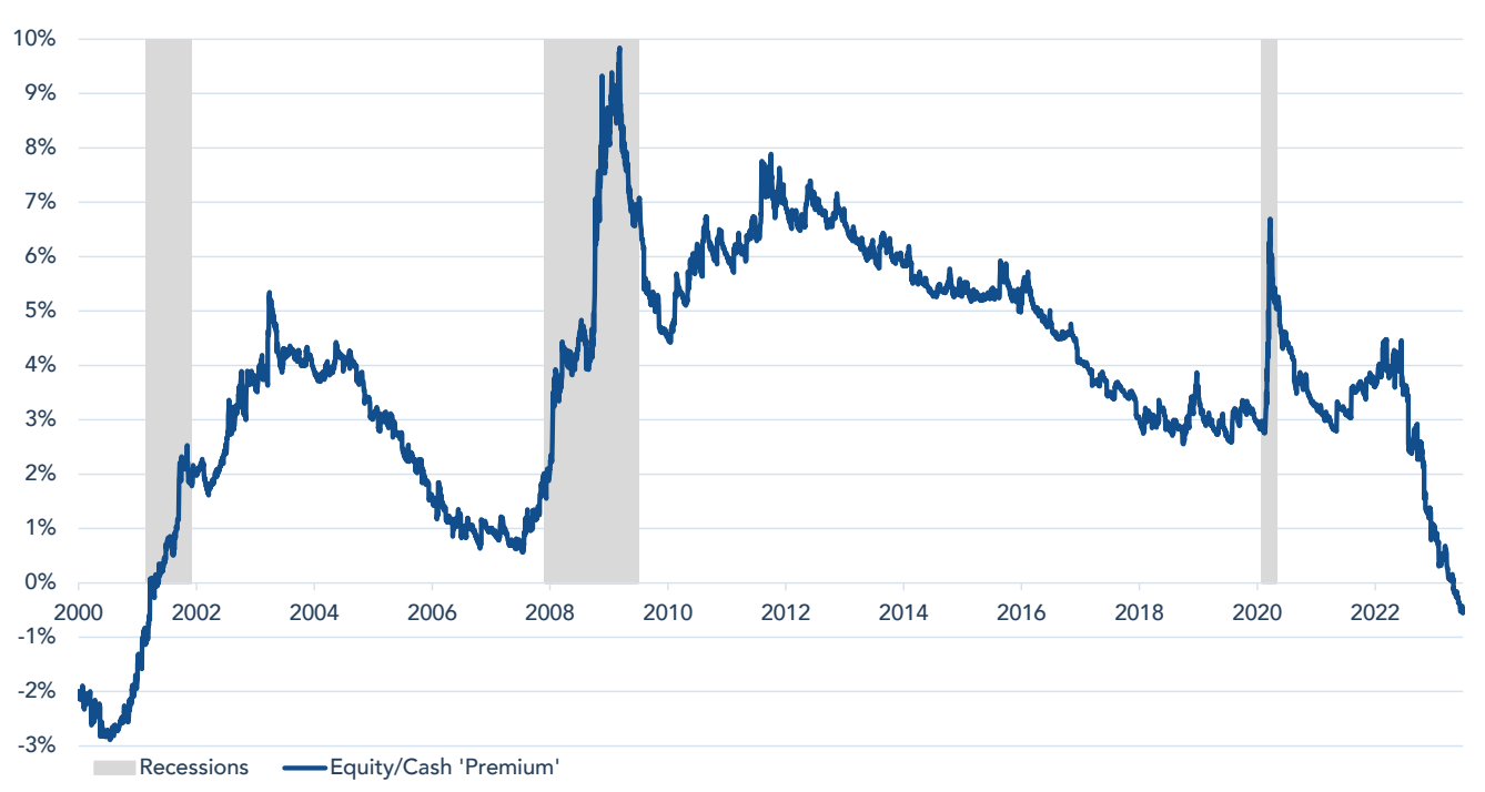
FIGURE 1 - US EQUITY EARNINGS YIELD PREMIUM TO FED FUNDS RATE

Past performance is not a guide to future performance.